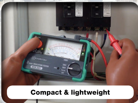
Compact & lightweight